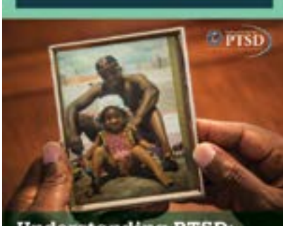
Understanding PTSD: A Guide for Family and Friends

To learn more about PTSD and PTSD treatments , check out our companion booklets at https://www.ptsd.va.gov/publications/print/understandingptsd_booklet.pdf https://www.ptsd.va.gov/publications/print/understandingptsd_family_booklet.pdf